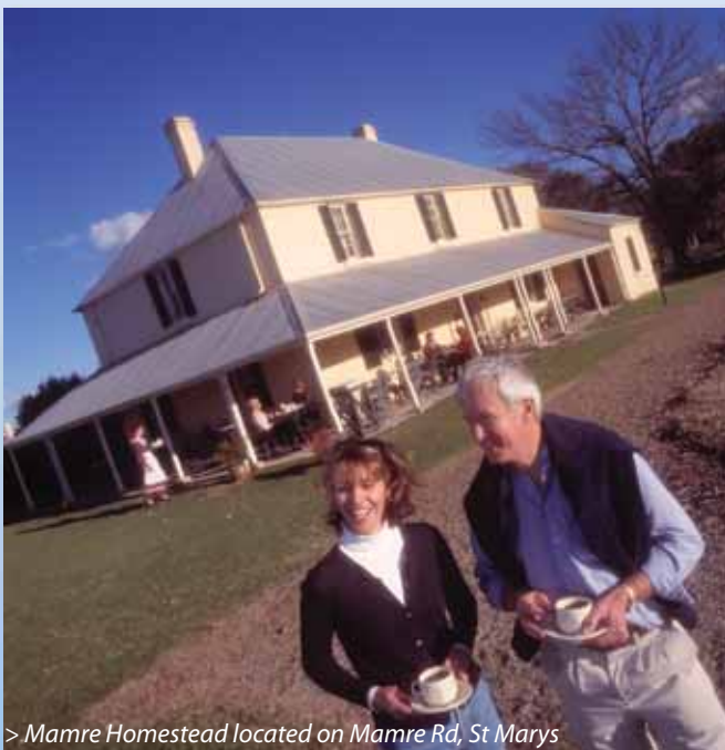
> Mamre Homestead located on Mamre Rd, St Marys