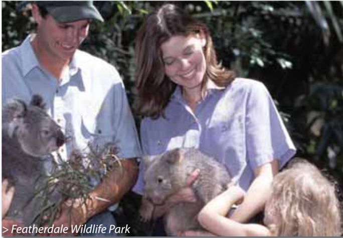
> Featherdale Wildlife Park